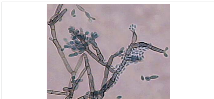
Figure 5: Microculture aspect.

Colonies of the fungus were subjected to MALDI-TOF MS analysis to identify species of the etiologic agent. Standard protein extraction was performed using ethanol and formic acid [6] and 1 \mu L aliquot of the sample was submitted to MALDI-TOF MS analysis using the Vitek MS™ instrument (bioMérieux). For each acquisition group, a standard ( Escherichia coli ATCC 8739) was included to calibrate the instrument and validate the run. Spectra were generated using Launchpad™ v2.8 software (bioMérieux) and analyzed using SARAMIS Premium v4.11™ for Research Use Only (RUO) software SARAMIS Premium v4.11™ (bioMérieux).