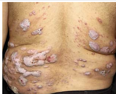
Figure 1: Multiple verrucous lesions of different sizes affecting the patient's back.

Culture of the lesion smears, performed in Sabouraud dextrose agar medium, led to the morphological identification of a species of Fonsecaea as an etiological agent after the 15th day of culture and microculture (Figures 4,5).