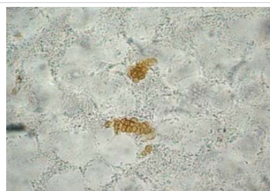
Figure 2: Direct mycological examination of the verrucous lesion demonstrating muriform bodies.