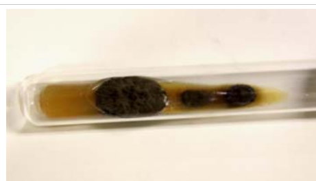
Figure 4: Black aspect of culture on Agar sabouraud medium.