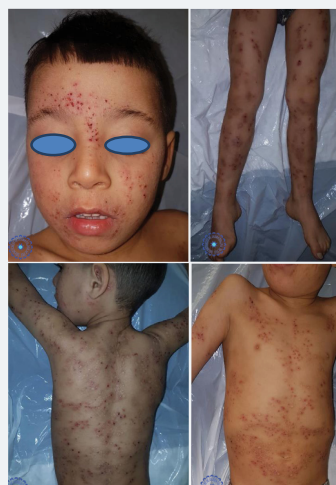
Figure 1: Clinical images showing multiple widespread erosions with clear content vesicles grouped in bouquet and rosette, surmounted by places of hemorrhagic crusts, on the face, trunk, limbs and scalp.

LABD is a rare autoimmune vesiculobullous disease with an incidence of 0.2 to 2.3 cases per million-population per year [4]. There are 2 variants: LABD of the adult and of the child, often called chronic bullous disease of childhood [5]. In the later, the disease develops after six months of age, and shows incidence peaks in preschool children, as in our case [6]. Although both humoral and cellular immune response are involved [4]. In fact, it is speculated that IgA autoantibodies produces chemotaxis of eosinophils and basophils that degranulates releasing their lysosomes, which is responsible for the formation of the subepidermal blisters [2]. However, while most cases of LABD are idiopathic, it can be induced by several drugs, mostly vancomycin [4], or non-steroidal anti-inflammatory agents. Some cases can also be preceded by upper respiratory infections [3].