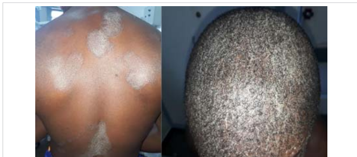
Figure 1: Plaques of follicular spin-sized scaly papules on the back with scaly scalp in a young black man.

A 17-years-old young man presented with a one-year history of relapsing and remitting multiple asymptomatic-to-mildly itchy erythematous scaly plaques of different shapes and sizes. Anamnesis did not find any history of infection or prior drug intake. Clinical examination revealed multiple erythematous, spiny, 1–3 mm sized, follicular, hyperkeratotic papules resulting in plaques on the trunk, both elbows and knees, with diffuse scaly scalp (Figure 1). Scales were thin with a shiny appearance. Palms, soles and nails were not affected. General status was conserved and no lymphadenopathy was found. Histopathologic examination of a biopsy specimen taken from the trunk and arms showed acanthosis, hypogranulosis and marked parakeratosis in the follicular epithelium and the interfollicular epidermis with neutrophilic microabscess and keratotic plugs (Figure 2). Based on these findings a diagnosis of follicular psoriasis (FP) was made. Oral methotrexate was started allowing a remarkable clinical improvement. After eight weeks the patient was totally remitted and methotrexate was finally stopped after six months.