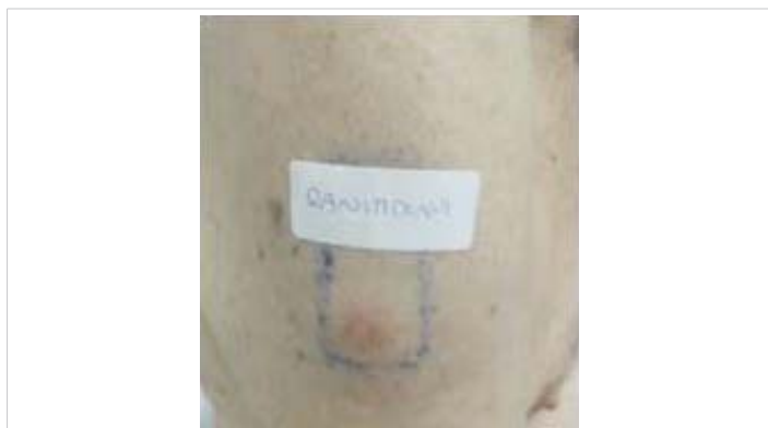
Figure 1: Positive intense result on patch test at 48 hours.

A month after, patch tests were repeated with ranitidine and famotidine (both at 30% concentration in petrolatum base). Ranitidine results showed an intense positive result at 48 hours and an extremely strong positive result at 96 hours (Table 1). Famotidine results were negative.